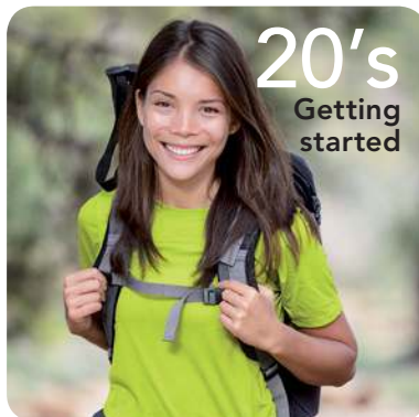
20's Getting started

Your adviser may be a specialist in one area of advice, such as personal insurance, or provide service across a broad range of advice needs. To find out more about your adviser's areas of specialisation refer to their Adviser Profile attached.