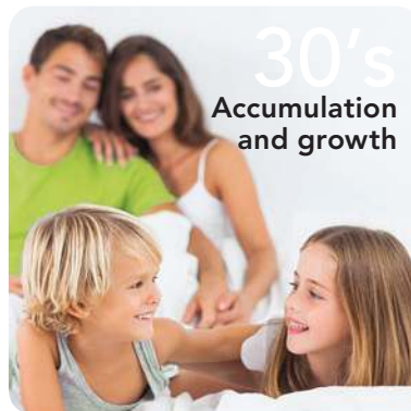
30's Accumulation and growth